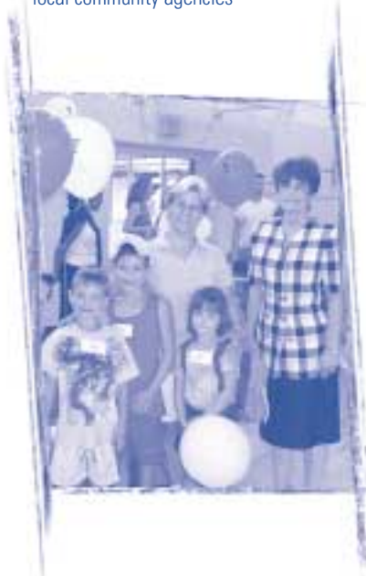
Corporate Volunteer Council's 7th Annual Back-To-School-Clothes-for-Kids project