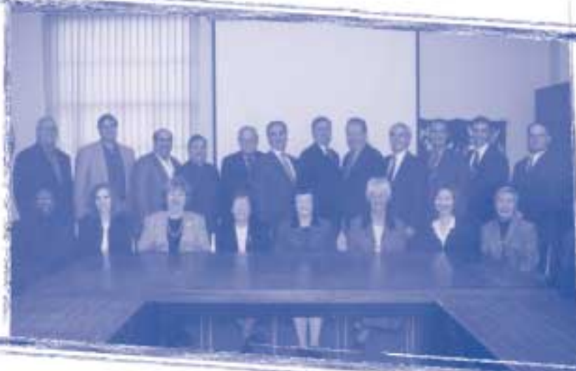
2002 Valley Advisory Committee

The Valley Advisory Committee, through its Valley Needs and Opportunities Project, established a web page in June 2002. The web page, which originated in response to needs identified by the community, provides information about grant opportunities that may be appropriate for Valley-based organizations. The page also contains information about workshops and grants research opportunities. The on-line address is www.valleyadvisorycommittee.org .