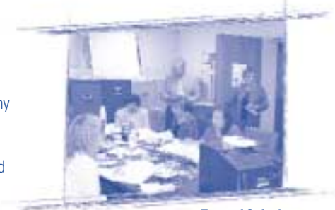
Town of Oxford