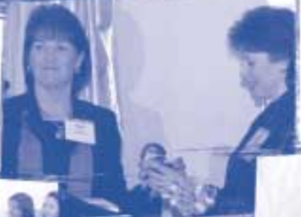
Below: Iroquois Gas employees donate an afghan to The Umbrella program