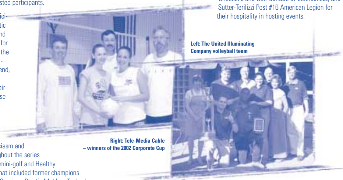
Left: The United Illuminating Company volleyball team