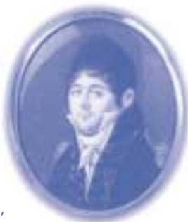
Commodore Isaac Hull