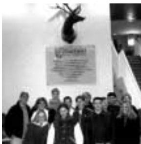
Youth Leadership members take a field trip to Fairfield University