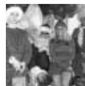
Santa, Mrs. Claus and the elves sponsor the 2nd annual Holiday Celebration at Shelton Famers' Market for 200 Valley kids