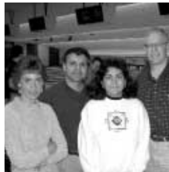
Tele-Media Cable, Corporate Cup winner

Competitors also enjoyed the benefits of the healthy meal series prepared by the chefs at Griffin Hospital and a 12-week stress-reduction class. When all was said and done, Tele-Media Cable had accumulated 107.75 points which was five points better than runner-up Griffin Hospital. Seven different companies won the eight events held as part of the series with newcomer PerkinElmer Precisely being the only one to win two events.