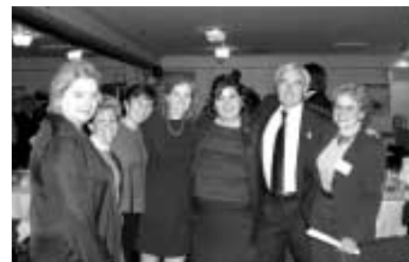
Valley United Way staff celebrating at last year's annual meeting