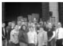
Pitney Bowes collected 4,500 lbs. in their food drive and members transferred it to Ansonia Community Action