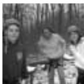
Members attend teambuilding retreat at Camp Jewell