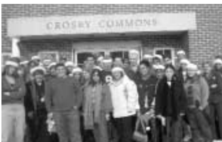
Valley students carol to the sick and elderly during the holidays