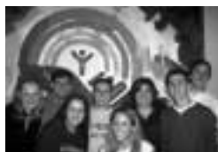
Fairfield University student government officers train Youth Leadership officers and members