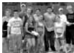
A fun car wash at McDonald's on Rte. 34 raises funds for Rock the Valley Concert