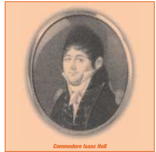
Commodore Isaac Hull

doors of opportunity to the young; who nurture the spirit of volunteerism of which we are so justly proud; who maintain the human services that enable so many to live in the quiet dignity we all cherish. In short, these are the people who are in the forefront of the struggle to provide a better way of life to every age and generation.