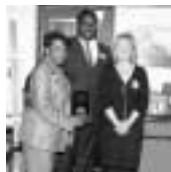
Wachovia Bank receives Corporate Excellence Award from Tinney Community Center