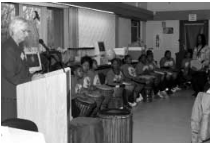
Drums Not Drugs performs at the Valley Needs and Opportunities Annual Event at the Kellogg Environmental Center

The Kellogg Center in Derby hosted VNOP's annual event in April. The focus of the event was grassroots and civic leadership. During the event, participants had the opportunity to participate in a town-hall-style discussion.