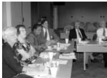
The Planning Subcommittee of the Valley Advisory Committee go on retreat at Health Net.

The Planning Subcommittee of the Valley Advisory Committee, which acts as the steering committee for Needs and Opportunities held a half-day planning retreat at Health Net in Shelton on September 4, 2003. The retreat provided an opportunity for members to review accomplishments and identify strategic directions and goals.